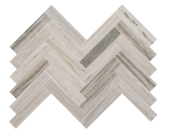
OPEN HORIZON MARBLE M110 (VEIN-CUT) 1" x 6" Chevron Mosaic - Honed