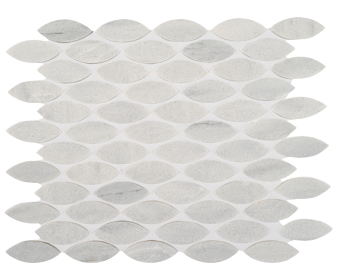
CANDID HEATHER MARBLE M109 (VEIN-CUT) 1" x 2" Leaf Mosaic - Honed