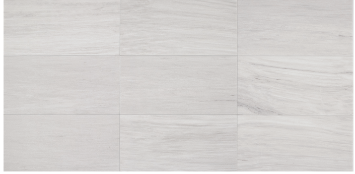
CANDID HEATHER MARBLE M109 (VEIN-CUT) 12" x 24", 3" x 8" - Honed 12" x 24" - Polished