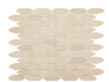
HONEST GREIGE LIMESTONE L101 (VEIN-CUT) 1" x 2" Leaf Mosaic - Honed