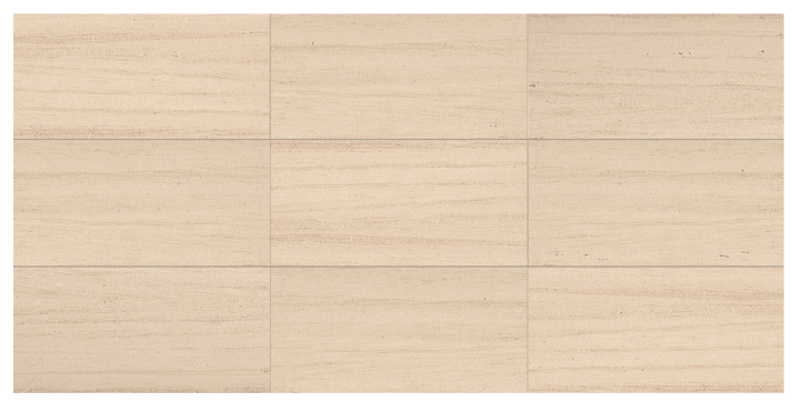
HONEST GREIGE LIMESTONE L101 (VEIN-CUT) 12" x 24" - Honed