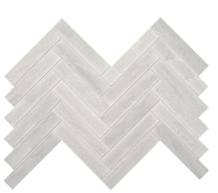
CANDID HEATHER MARBLE M109 (VEIN-CUT) 1" x 6" Chevron Mosaic - Honed