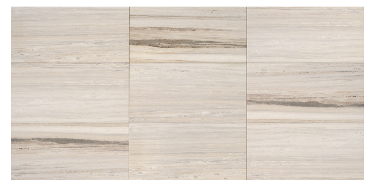
OPEN HORIZON MARBLE M110 (VEIN-CUT) 12" x 24", 3" x 8" - Honed 12" x 24" - Polished