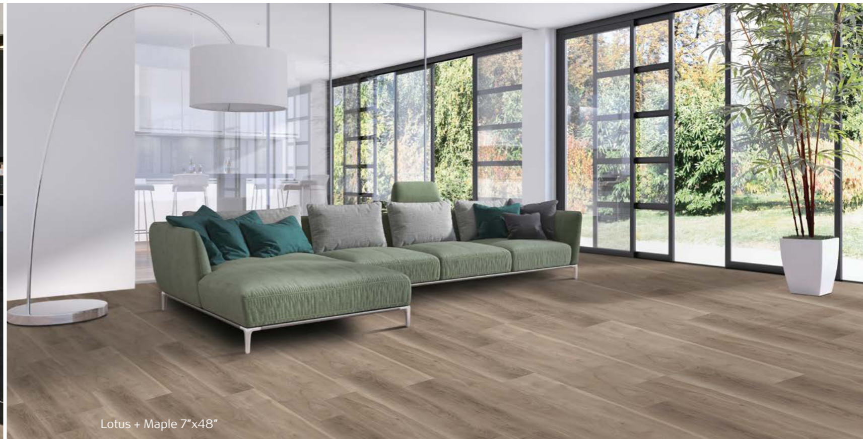
Lotus + Maple 7"x48"