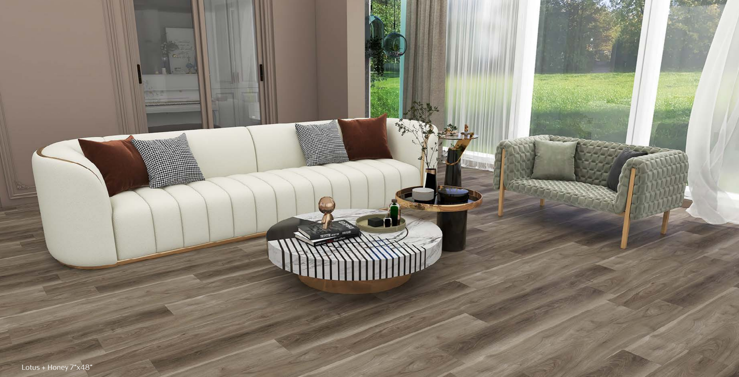
Lotus + Honey 7"x48"