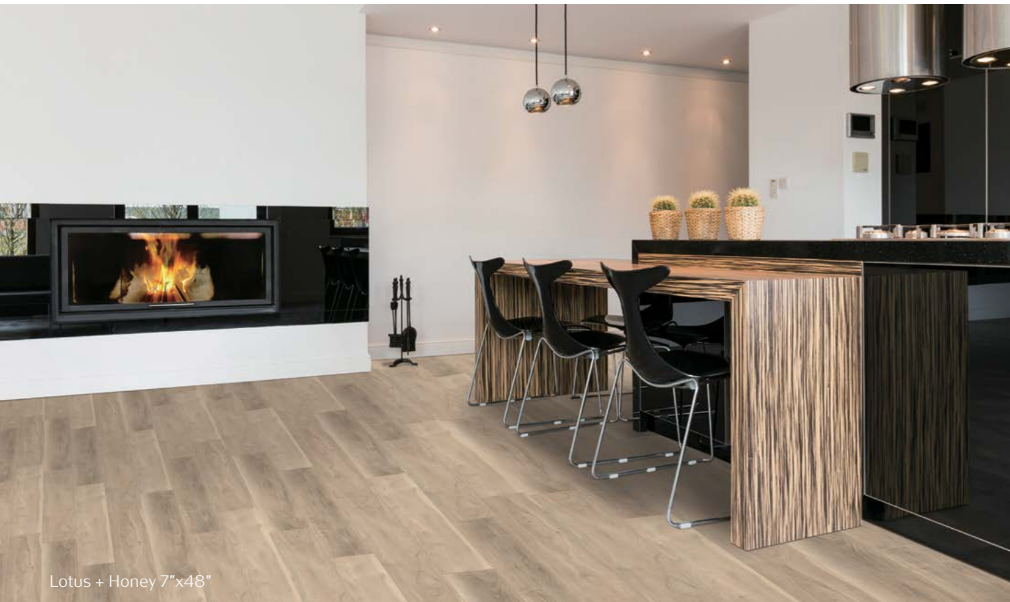
Lotus + Honey 7"x48"